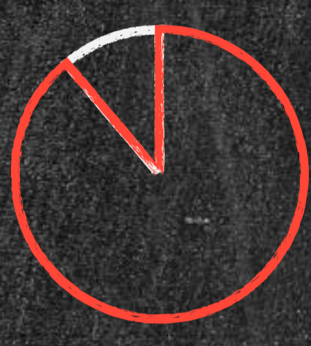
12- to 19-year-olds

Students should therefore have different competences in order to be able to work confidently with digital media in class and to move safely on the internet.